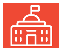
GOVERNMENT RELIEF ACCESS