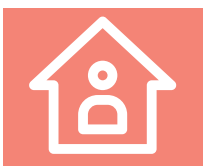
HOME ISOLATION SUPPORT