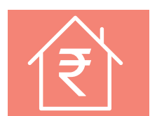
LIVELIHOOD LOSS SUPPORT