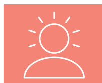
COVID PROTECTION AWARENESS