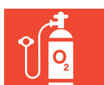
STRENGTHENING COVID CARE CENTERS